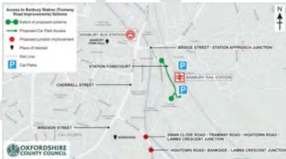
Banbury Tramway Road Improvements