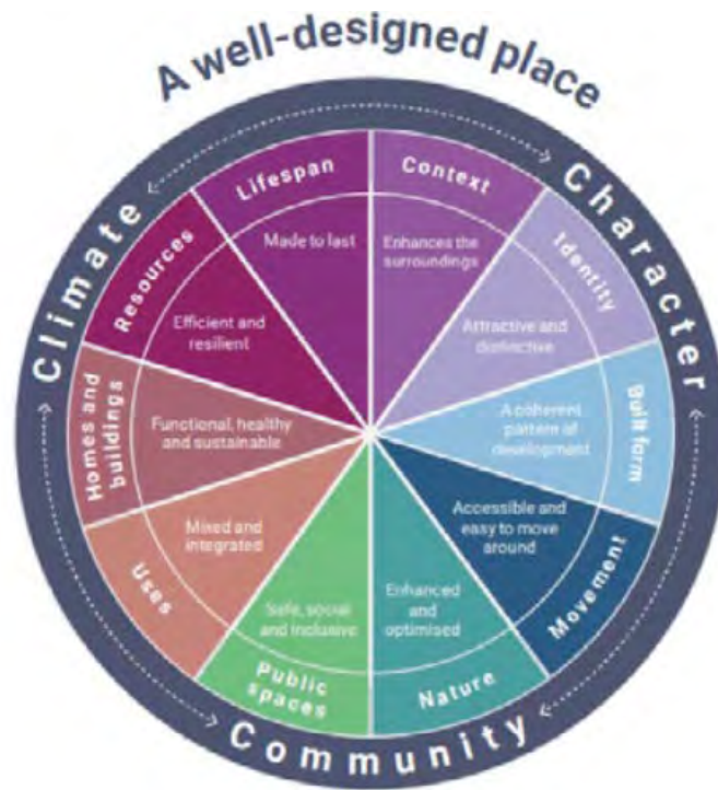
Figure 3: The ten characteristics of well-designed places (National Design Guide)

3.311.3.312. Masterplans are an important tool used by designers to set out the strategy for a new development and to demonstrate that the general layout, scale and other aspects of the design are based on good urban design principles. The Cherwell Residential Design Guide SPD sets out the principles of good design that must be demonstrated through the preparation of a masterplan as part of applications for major development and development of allocated sites. These, and other masterplans, should be produced in partnership with Cherwell District Council, the community and other stakeholders. For smaller developments, proposals need only be supported by a design and access statement which should provide a detailed design assessment proportionate to the scheme proposed.