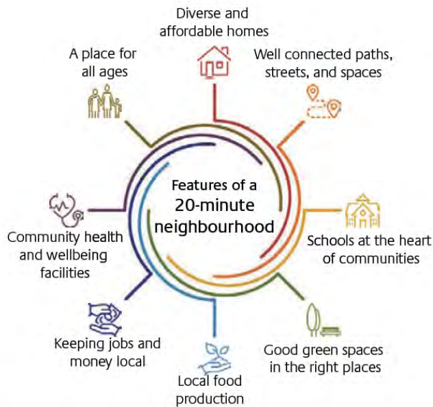
Figure 4: 20 Minute Neighbourhoods