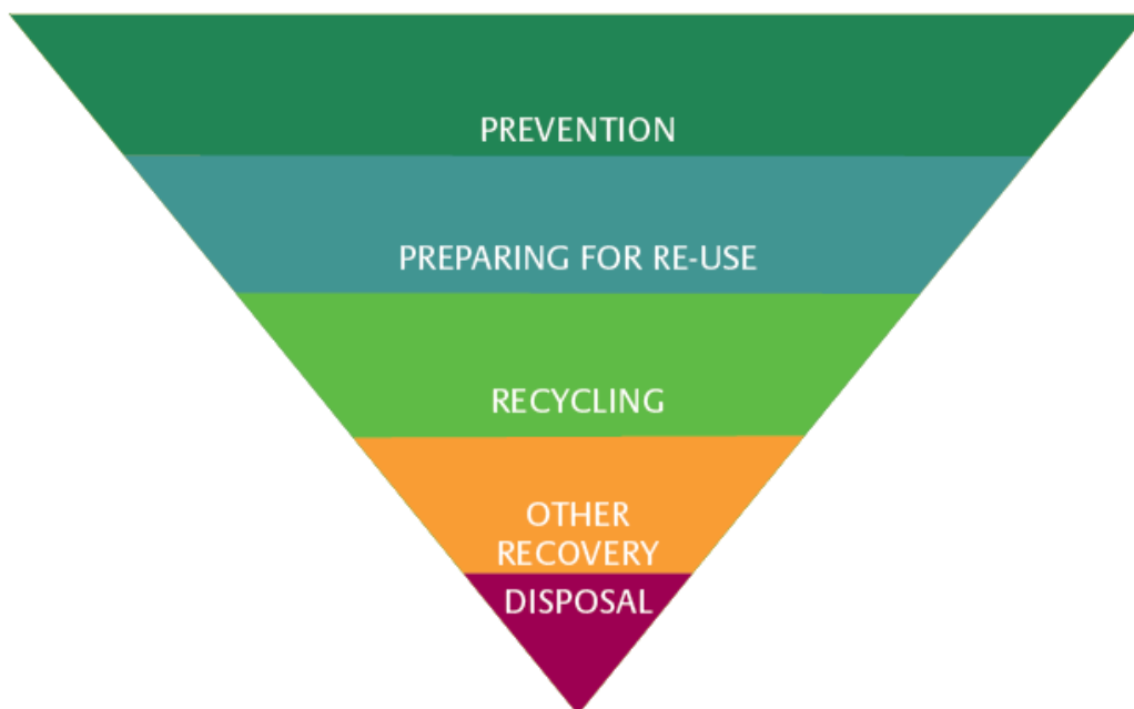
Figure 2: Waste Hierarchy

3.123.3.124. Given the pressing urgency of climate change and the need to embed the principles of the circular economy into all areas of our society, we encourage developers to consider including community spaces that help reduce waste and build community cohesion through assets such as