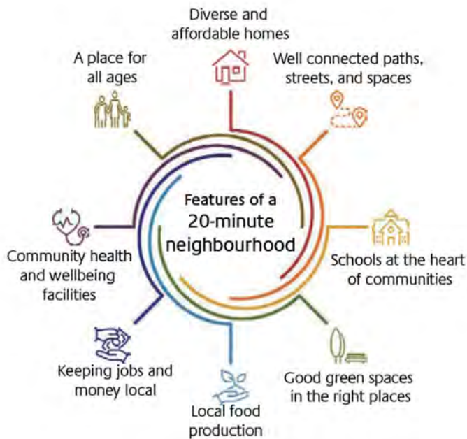
Figure 4: 20 Minute Neighbourhoods