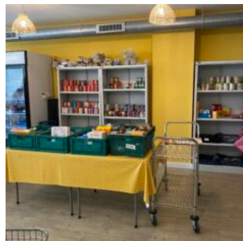
Bicester Food Bank display