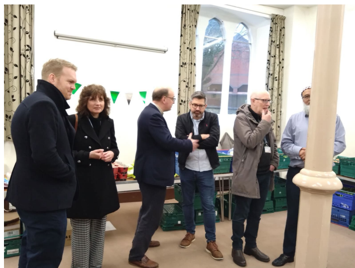
Members of the Food Insecurity Scrutiny Working Group visiting the Banbury Larder Food Bank in Banbury.