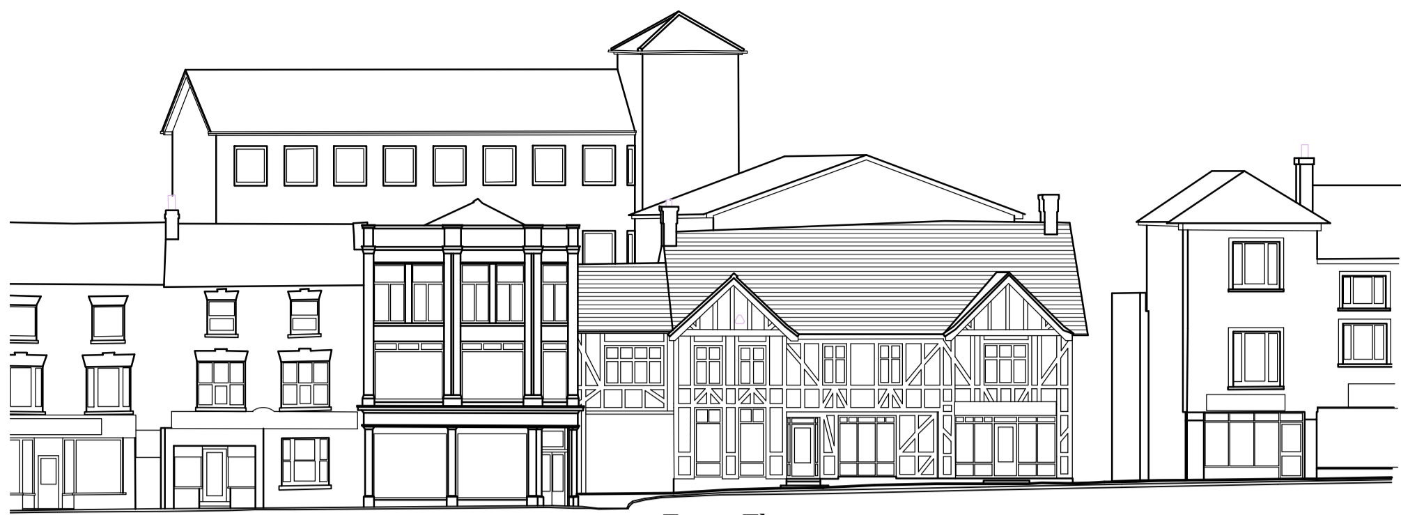
Front Elevation existing windows retained and made good with secondary glazing